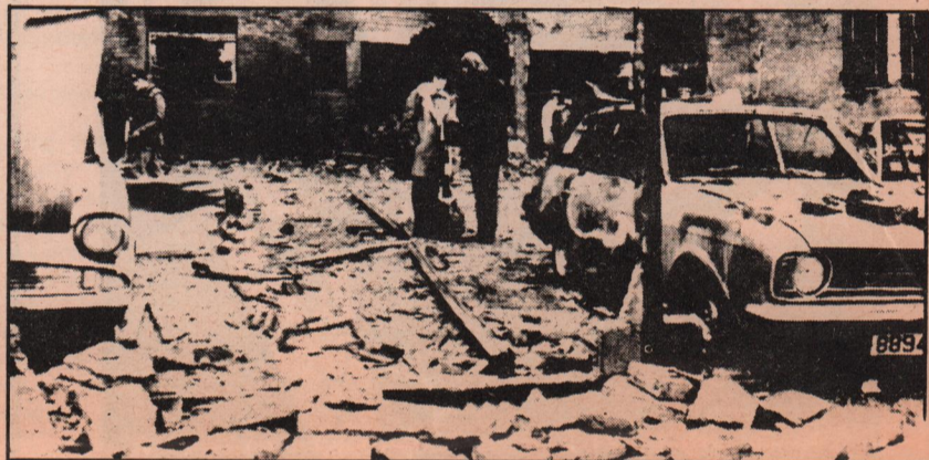
Ritz cinema, Belfast:

The Labour Movement should convene a conference of Trade Unions, tenants' associations, shop