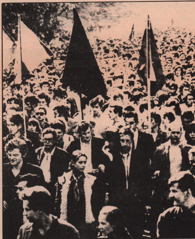
May 1968: Workers shake France to its roots. In 1974 the workers all over Europe are beginning to move.

The position of strength of the LPYS, with the commitment to a Marxist programme on the part of its majority, has not fallen from the skies. It has been built on a foundation of painstaking, consistent work, struggling with confidence even in times of low ebb in the movement. Now the crisis of British capitalism has driven home the correctness of our policies.